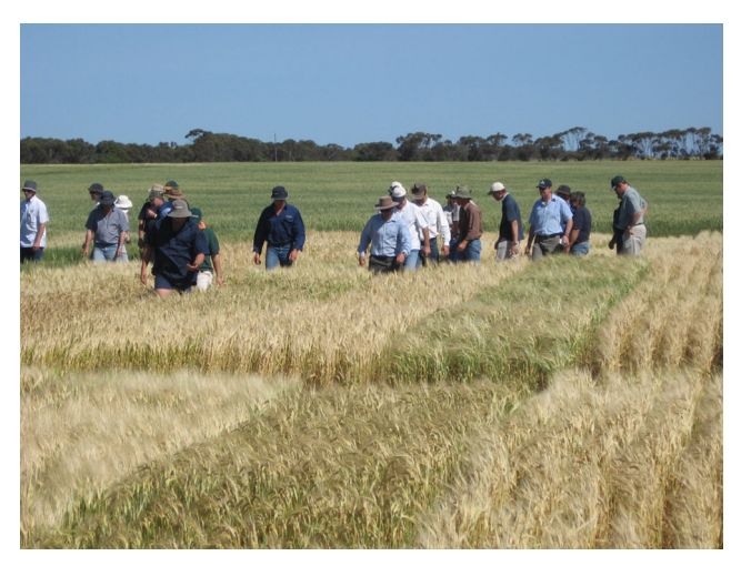
Fig. 1 Farmers inspecting cultivars and agronomic treatments in a yield potential trial on wheat in Western Australia. Farmer participation can be an important step in designing field experiments and in assessing responses. Yield advances must be statistically and economically significant and practical to apply on a broader scale.

yields (e.g. Loss and Siddique 1994; Evans 1987; Richards 1991; Qin et al. 2015). However, there have been some suggestions that there may be a need in the future to extend the current, known estimates of potential yield (Passioura 2006; van Rees et al. 2014). It is axiomatic that agronomic practices appropriate to support new genotypes will need to be researched concurrently.